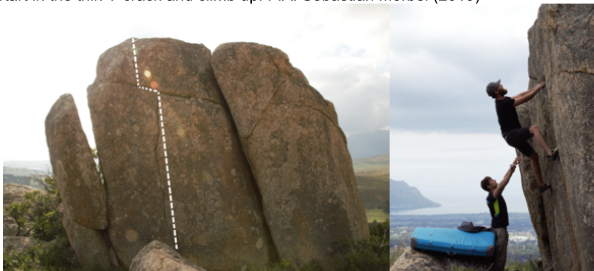
Photo 3. Crack at Tee-iffany's